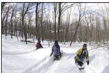
Mad River Rocket sledding