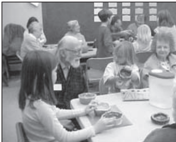
Senior citizens take part in the empty bowl project at Union Elementary.

Community Connections at Union Elementary School serves about 45 children a day with academically oriented after-school programs including Homework club, Spanish, computer lab, and storytelling. Through a strong partnership with Montpelier Recreation Department, 114 children attended summer camp last year. Community education programs are equally popular, with opportunities for parents and children to participate weekly in activities like fiber arts, ceramics, and other art workshops.