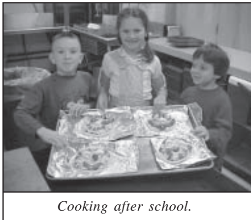
Cooking after school.

MHS Community Connections programs including outing club, diversity club, Solon dance club, philosophy club, weight training, fencing, build and design team and community service club are developed and led by students, faculty and