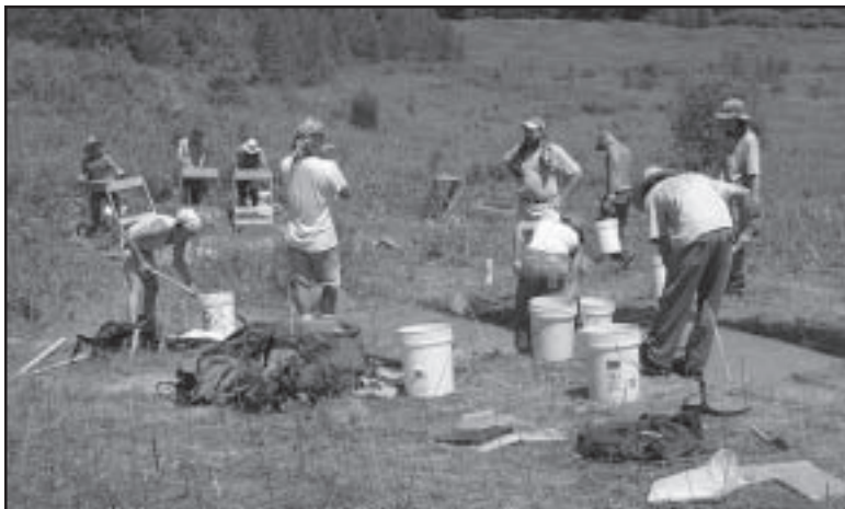
Students on a dig site learning archeology techniques first-hand at Community Connections' Archeology Field School, last summer.

Contact us at: Community Connections 223-3456, 223-1957 (fax) www.communityconnections.us